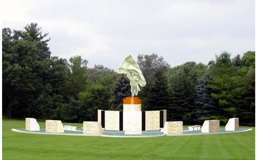
This image appeared in the "Neighbor" Section of The Daily Herald Newspaper Tuesday, November 11, 2003.

BDS was also asked to come up with a computer generated rendering of the artist design.